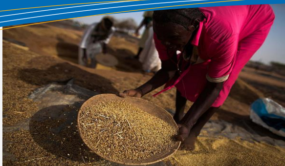
IDP woman collecting millet in South Darfur