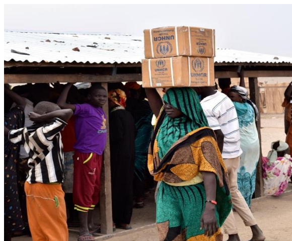
A South Sudanese refugee in White Nile State receives assistance

UN Habitat underlined the challenge in Sudan of responding to the large number of IDPs, refugees and returnees, who need urgent humanitarian assistance, durable solutions and development support. In addition, the refugee influx from South Sudan—of whom a large number are temporarily accommodated in White Nile State—are adding pressure on available basic services and resources, according to UN Habitat.