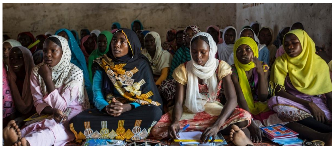
Sudanese refugee women and girls from Darfur in a camp near Goz Beida, eastern Chad (2017, UNHCR)

With a shortfall of US$37.7 million to respond to recovery, returns and re-integration, Noriko Yoshida, UNHCR Representative for Sudan, appealed for urgent funding to assist the efforts of the Government of Sudan to provide durable solutions for returning communities.