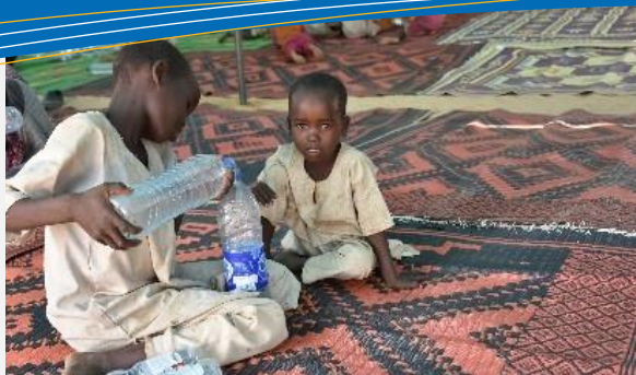
Sudanese refugee children arrive in Tina, North Darfur from Chad (April 2018)