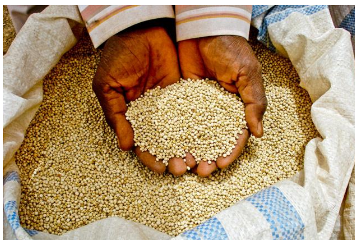
Sorghum is a staple crop in Sudan

The national average retail price of sorghum is expected to follow an increasing trend during the coming lean season (May/June-October), reports the World Food Programme (WFP) in its Monthly Market Update for Sudan . Retail prices of sorghum increased by more than 10 per cent in two out of 12 states, while West Darfur showed an increase of 13.8 per cent. Wholesale prices of sorghum, millet and sesame slightly