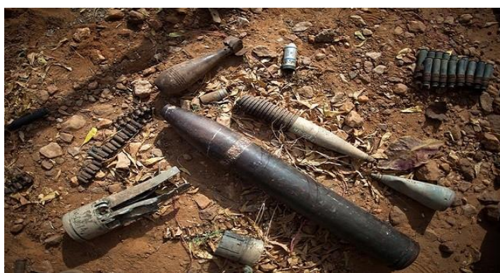
Unexploded ordnances in Darfur (UNAMID, 2016)

In Kassala, international partners, high-level government officials, senior diplomats, UN Staff and the local population came together on 4 April to celebrate the State's mine free status and the clearance of known landmines in the eastern states, marking 12 years of dedicated work of mine action