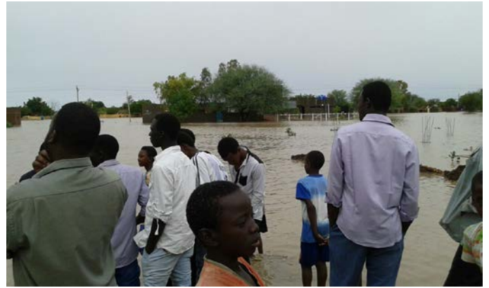
Flooding has affected thousands of people in Sudan (2016, SRCS)

Efforts are ongoing to verify the number of people affected, identify their needs and obtain an overview of the response to date. The government-led National Flood Task Force in coordination with key actors is continuing to monitor the impact of rains and flooding and coordinate the response. Government authorities, local communities and in some areas national and international humanitarian organisations are responding to the needs arising from heavy rains and flooding.