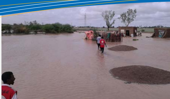
A flooded area in Al Gezira State (2016, SRCS)