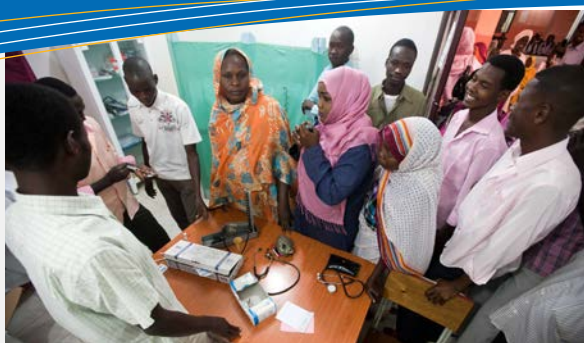
A clinic in Darfur