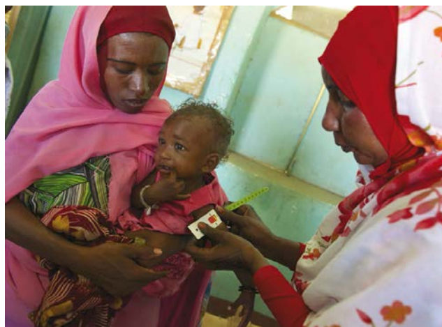
MUAC screening in Sudan (2014, UN)

The UN Children's Fund (UNICEF) reported in its Sudan Humanitarian Situation Report for October 2016 that the Federal Ministry of Health (FMoH) released the results of the national mass mid-upper arm circumference (MUAC) screening campaign, which was carried out between end of August and beginning of September 2016. Over 4 million children aged 6-59 months were screened across all 18 Sudanese states – representing 75 per cent of all children under five in Sudan – by UNICEF with support from the