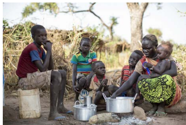
A Sudanese refugee family in a camp in South Sudan (2016)

The United Nations and its partners do not have crossline access to SPLM-N areas in South Kordofan and are therefore not able to verify these reported returns and humanitarian needs.