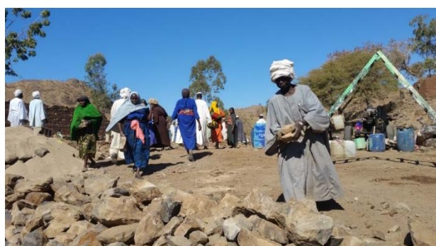
Community in Deribat, East Jebel Marra, preparing the ground for the installation of the solar panel water system

MC-Scotland will train and establish five community-based WASH committees to manage the water systems. The water systems will operate on an affordable water user fee model. This cost-recovery model, where the community contributes to a kitty, generates funds to cover