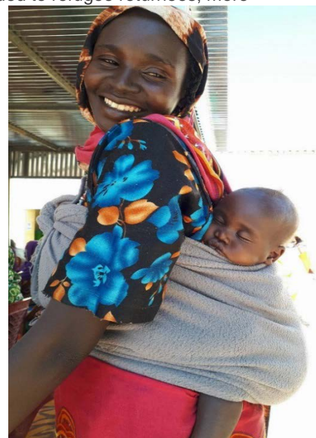
A woman and children happy to be back home in Dafag, South Darfur, after 10 years of exile in CAR

Approximately 750 returnee children need access to schools and qualified teachers.