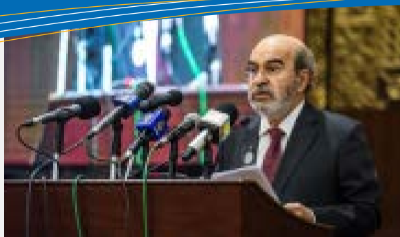
FAO Director-General José Graziano da Silva speaking at the Africa Regional Conference in Khartoum